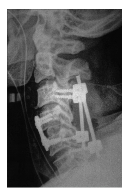
Fig. 3. Postoperative radiograph of a patient who underwent a combined approach.

the posterior approach, and a combined approach in the remaining cases.<sup>39</sup> A combined approach is generally used in cases with both ventral and dorsal compression of the thecal sac (Fig. 3) or if a patient with multilevel disease presents with kyphosis.<sup>40</sup> Fig. 3 depicts the postoperative radiograph of a patient with cervical canal stenosis from C3 to C6 with focal ventral compression at C4-5. This patient underwent anterior cervical discectomy with fusion at C4-5, followed by lateral mass screw fixation and laminectomy from C3 to C6 in the same sitting (one lower screw is in C5 and another at C6 because of fracture of one lateral mass during placement). A combined approach can be chosen in patients with significant ventral and dorsal osteophytic compression that cannot be handled holistically with single anterior or posterior surgery. In patients with severe osteoporosis, those with poor bone quality due to renal disease, or heavy smokers in whom poor bone fusion is anticipated, a combined approach can also be an option. A combined approach can also be considered in patients with significant focal kyphosis, posterior pathology, and multilevel decompression instability.14,40